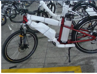
Foam bag packing