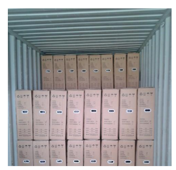
Foam bag packing