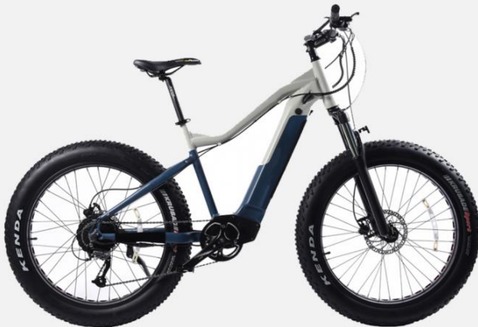
SUNTOUR GUIDE-26TNL FRONT FORK WITH LOCK