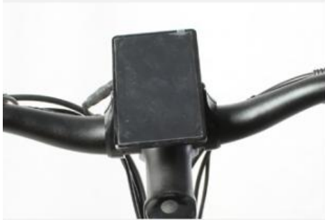
COLOR LCD DISPLAY C900E