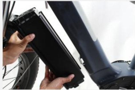
48V 14.5AH SAMSUNG LITHIUM BATTERY