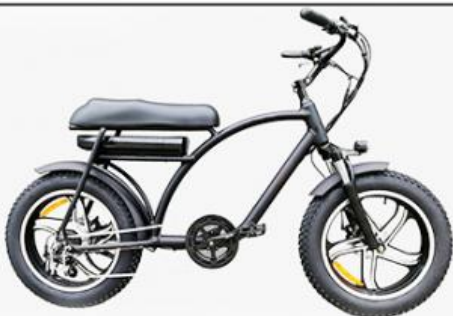
FAT TIRE ELECTRIC BIKE >