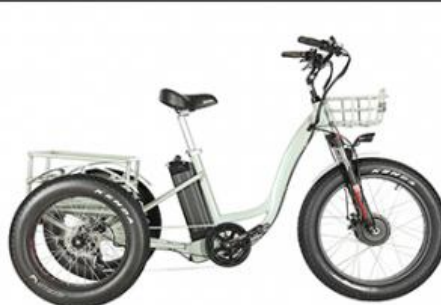
3 WHEEL ELECTRIC BIKE >