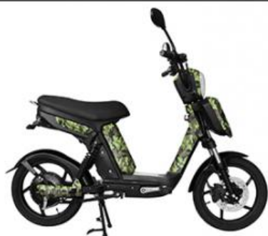
MOPED ELECTRIC BIKE >