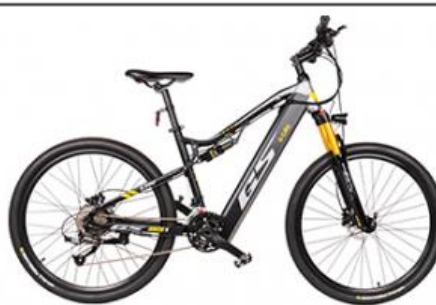
MOUNTAIN ELECTRIC BIKE >