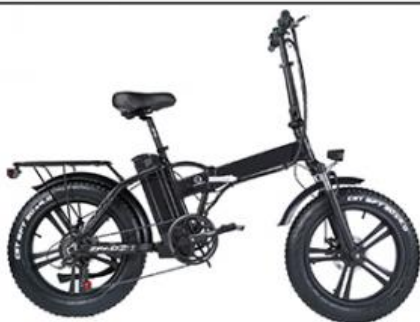
FOLDING ELECTRIC BIKE >