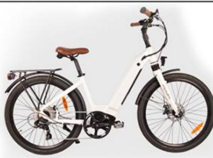
CITY ELECTRIC BIKE >