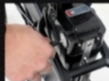
Open battery lock with key