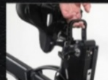
Pull out battery