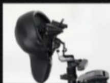
Lift the bicycle seat