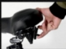
Open the bicycle seat bottom button