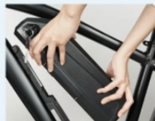
Pull out battery