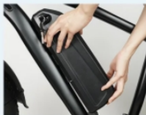
Hold the battery and push it upwards