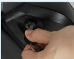
Open battery lock with key