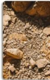
Gravel road Unobstructed