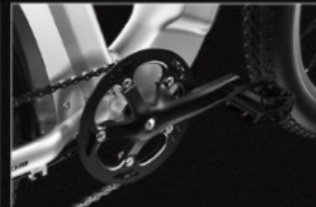
CNC dental discs