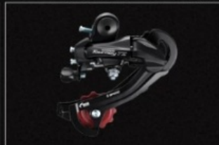
Shimano Shifting Rear Derailleur