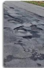
Pothole road unobstructed