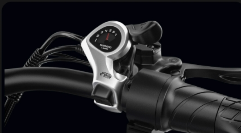
SHIMANO 7 SPEED