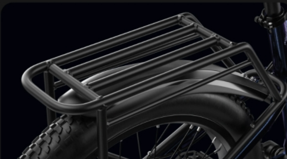
ALUMINUM ALLOY REAR SHELF