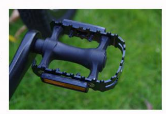
Alloy non-slip pedals