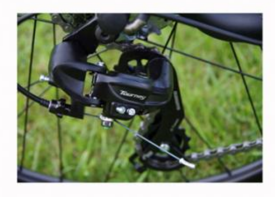
Shimano 24 speed gears(front 3*rear 8)