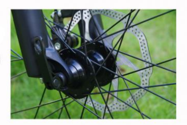
Front alloy hub with quick release axle