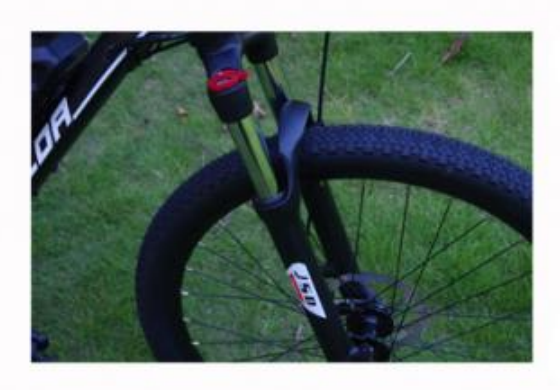
Front suspension fork with lockout