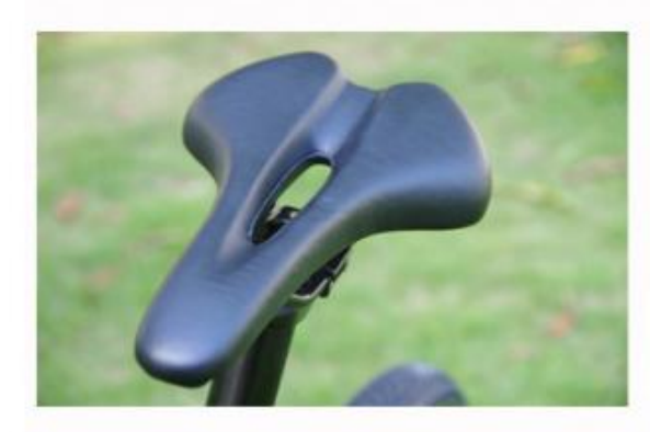
Sport comfortable seat