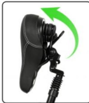
② Release the seat