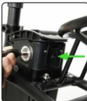
④ Now, the battery keyhole is empty