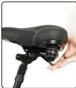
① Press the quick release button under the seat