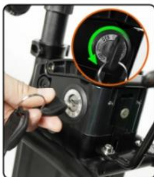
③ Turn the key to Lock