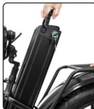
⑤ Remove the battery