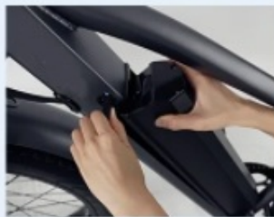
With the other hand simultaneously lift the battery up