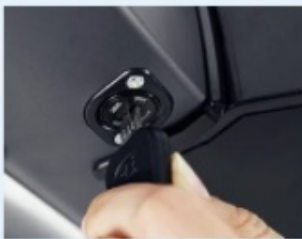
Open battery lock with key