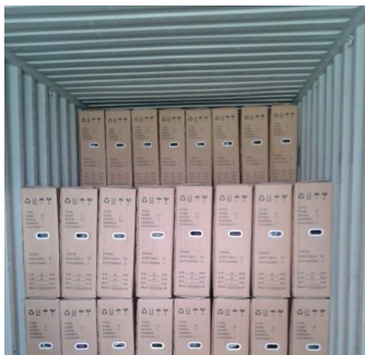
Foam bag packing