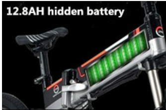
12.8AH hidden battery