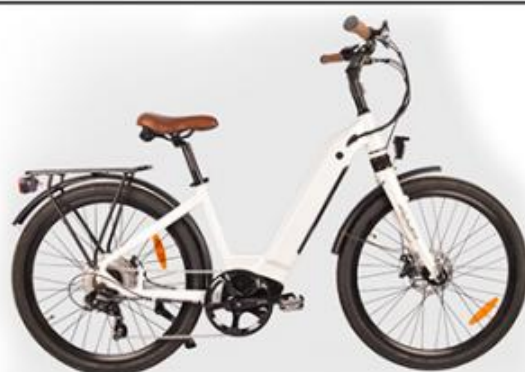
CITY ELECTRIC BIKE >