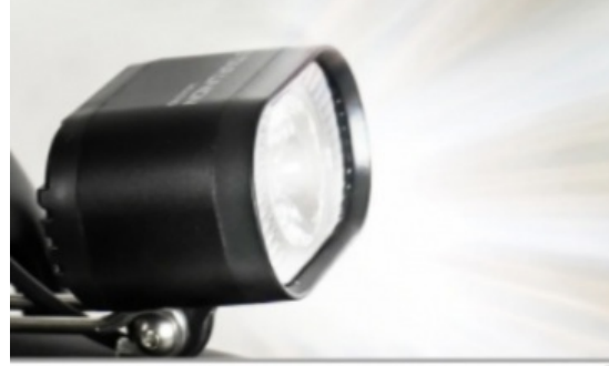
LED headlights No dead Angle adjustment freely