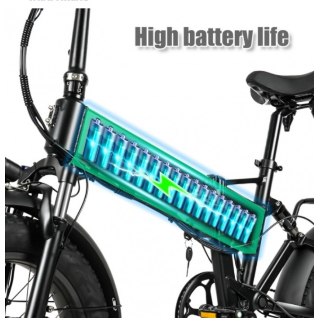
5.Remove the battery.