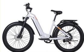
Real time photo