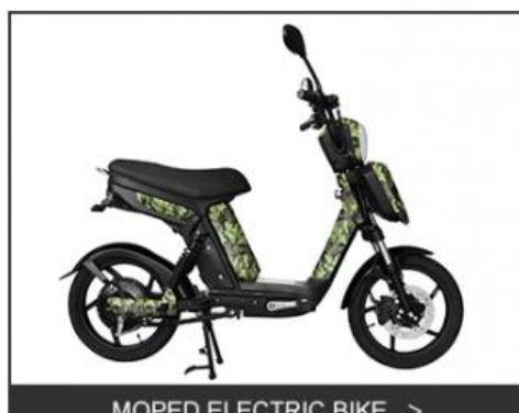
MOPED ELECTRIC BIKE >