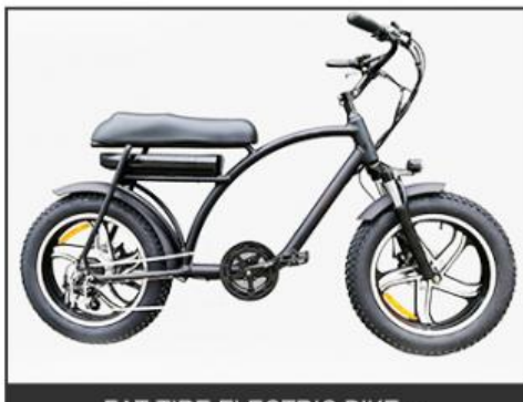
FAT TIRE ELECTRIC BIKE >