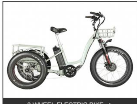
3 WHEEL ELECTRIC BIKE >