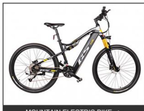
MOUNTAIN ELECTRIC BIKE >