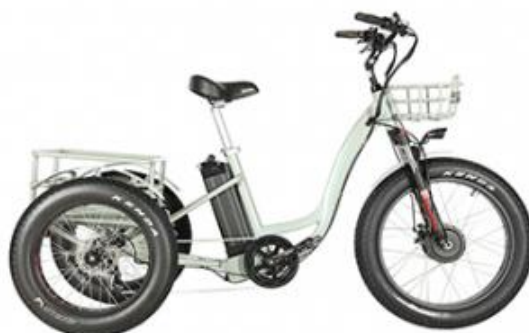
3 WHEEL ELECTRIC BIKE >