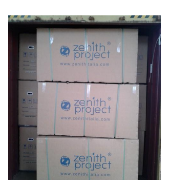
Our most professional packaging