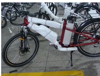
Foam bag packing