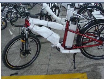
Foam bag packing