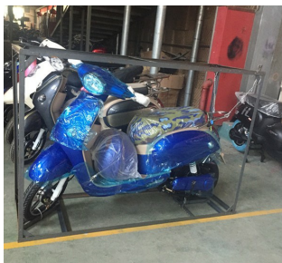
Steel frame pack inside