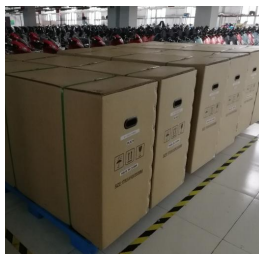
Solid Carton outside packing