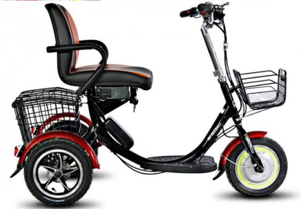
Name of the part