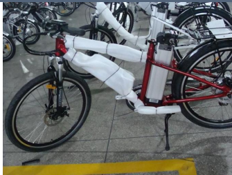
Foam bag packing