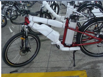
Foam bag packing