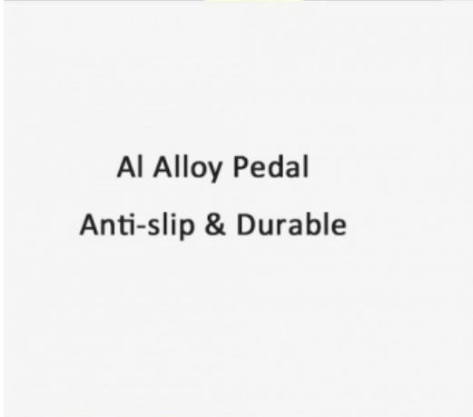
Al Alloy Pedal Anti-slip & Durable