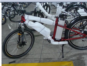
Foam bag packing