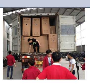
Steel frame pack inside