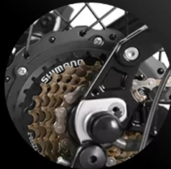
7S Free Wheel