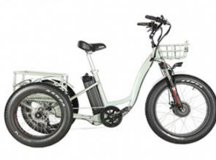
3 WHEEL ELECTRIC BIKE >