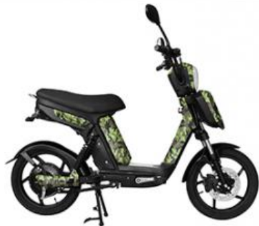
MOPED ELECTRIC BIKE >