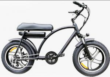
FAT TIRE ELECTRIC BIKE >