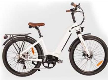
CITY ELECTRIC BIKE >