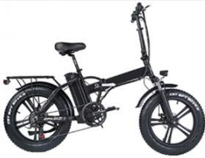
FOLDING ELECTRIC BIKE >